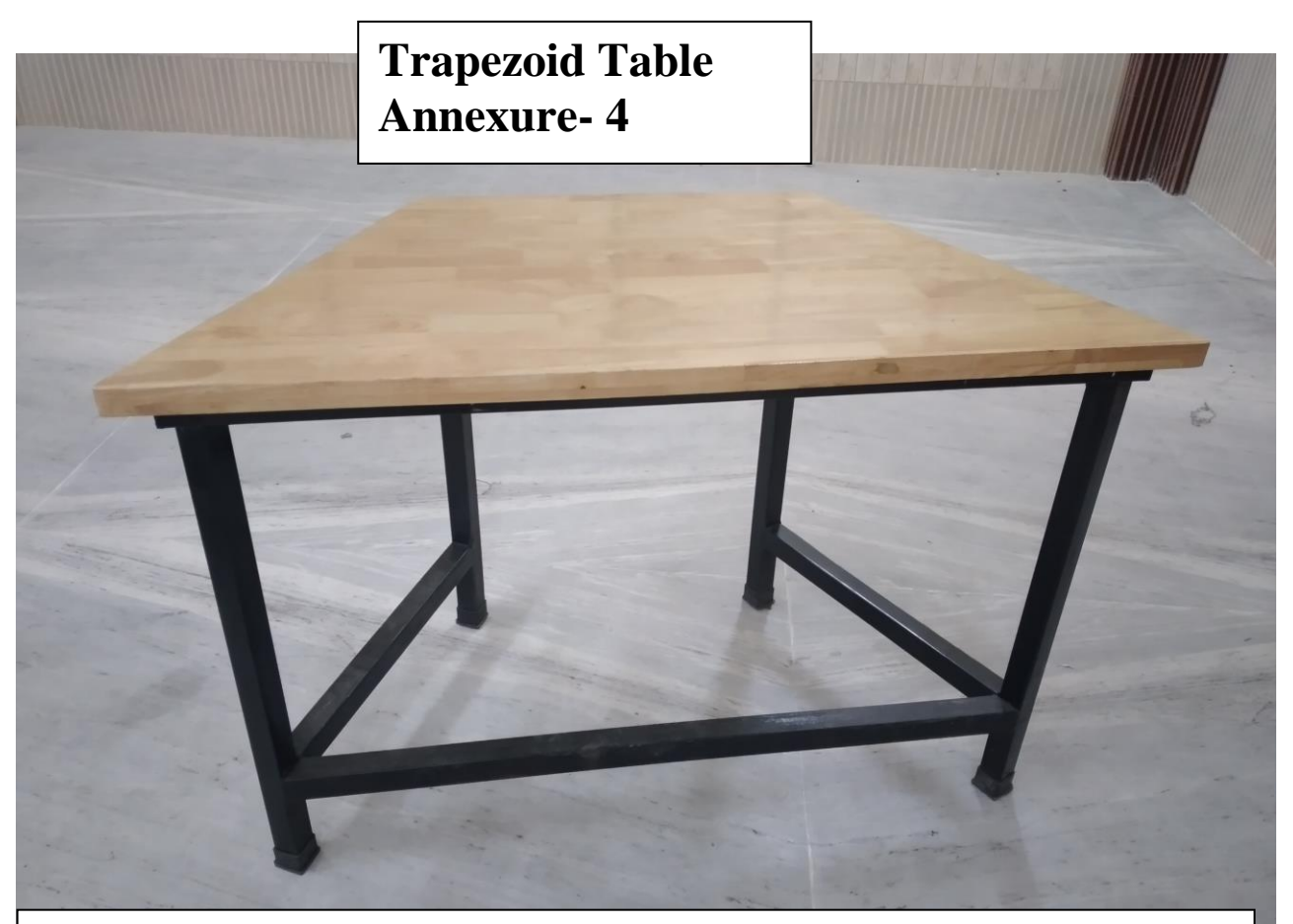
Table frames and stand with mild steel square pipe(32x32x3.6mm) with ball glide legs or some other good quality and durable options. Supplying classroom tables as per the specification, including finishing with Painting/Polishing. Complete with any additional necessary as required. The tables are of high quality and meet all requirements stated.