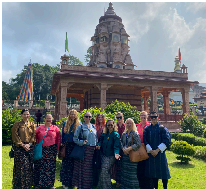
A group photo taken on ECU's field visit to Shivalaya Mandir

A delegation comprising ten enthusiastic students and two distinguished professors from Edith Cowan University (ECU), Australia, recently concluded a rewarding exchange programme at Samtse College of Education (SCE), fostering enduring memories and fortified international connections.