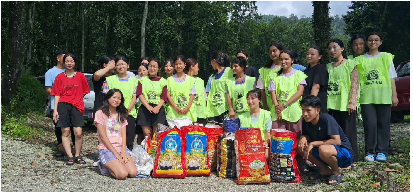
A group photo comprising of Y-Via and Y-Peer team members on their cleaning day