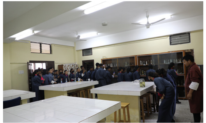
Students visiting the Biology Laboratory

and the School to strengthen collaboration but also fostered mutual engagement between the two educational institutions. One of the visiting students shared that “I have never been to SCE though I was born and raised in a nearby village. I am amazed by the facility in the college especially library. Who would not like to visit such as library? I would like to thank the college management and my school for arranging this visit la”