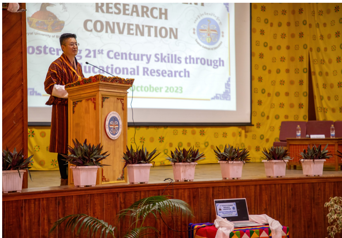
The President, delivering his keynote address during the convention