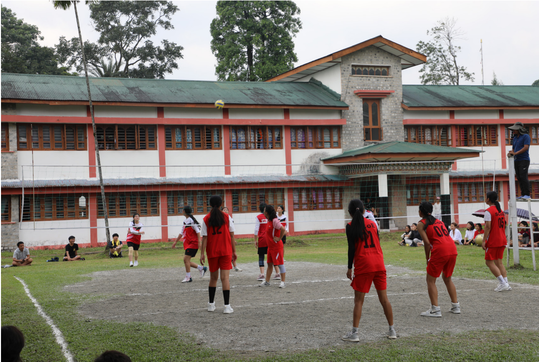
Volleyball tournament between Samtse College of Education and College of Science and Technology (Girls)

The Bhutan University Sport Federation event between the College of Science and Technology (CST), Gedu College of Business Studies (GCBS), and Samtse College of Education (SCE) was an exhilarating display of sportsmanship and competition. SCE hosted the home regional qualifying round on 14 th and 15 th October for CST and 21 st and 22 nd October for GCBS.