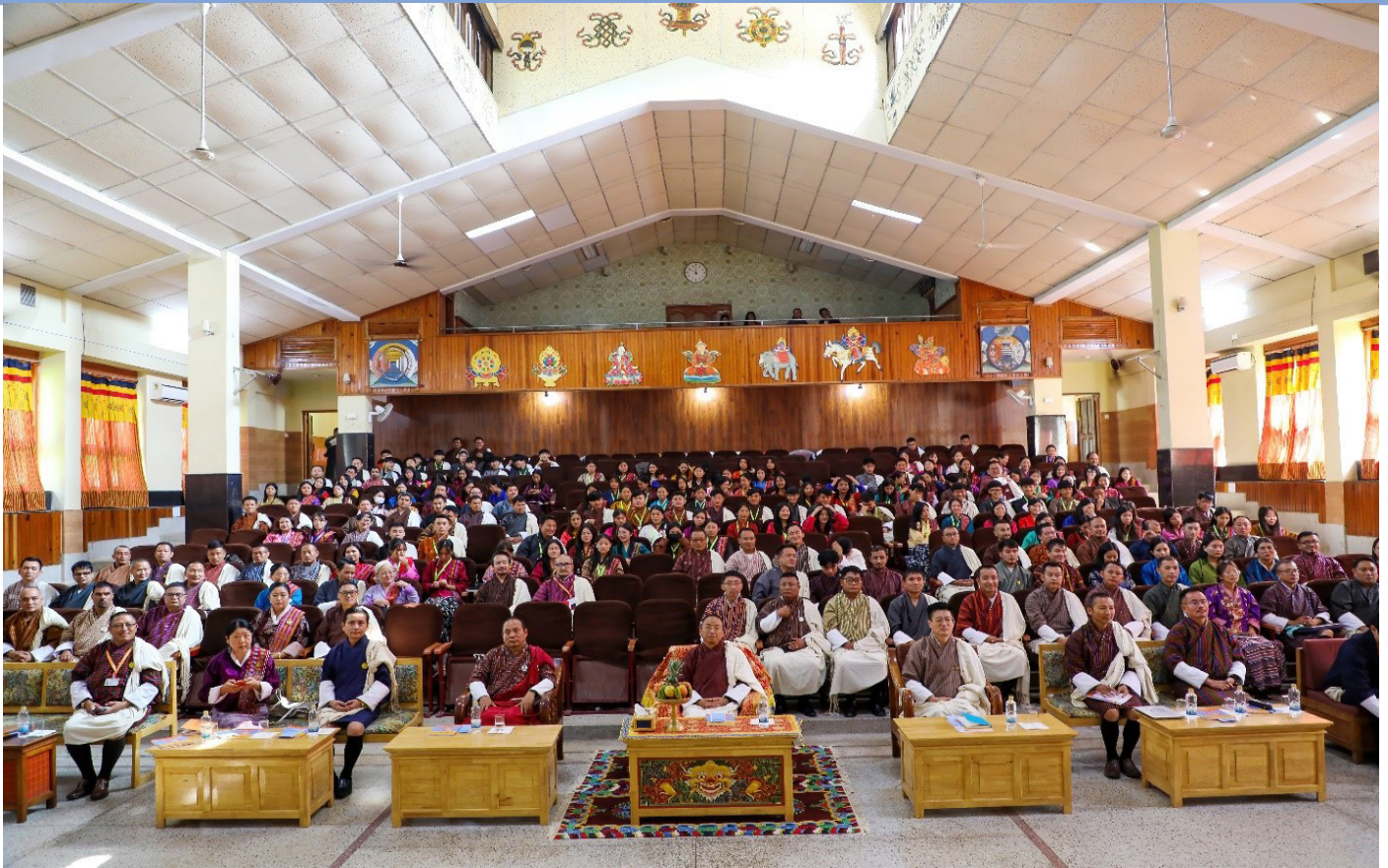
Hon'ble Acting Secretary, MoESD gracing the conference