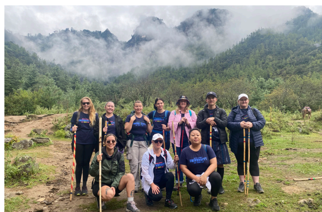
All set for a hike to Tiger's Nest

On September 29 th , 2023, as the Australian delegation bid farewell to their buddies at SCE, emotions ran high. Tears of sadness mingled with smiles of gratitude, filling the air as the exchange students and professors prepared to return home. SCE buddies shared tears and offered heartfelt prayers for the safe journey and bright future of their departing friends. The emotional farewell carried a sense of hope, with both parties eager to reunite for