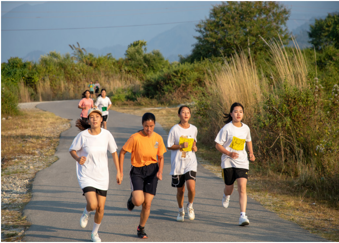
A group of girls fuelled by determination

Samtse College of Education hosted Annual Marathon on November 11, observing the 68 th Birth Anniversary of His Majesty the Fourth Druk Gyalpo, GNH Day, Constitution Day, and Children's Day. The event, strategically planned for faculty, staff, and students, aimed to foster unity and well-being.