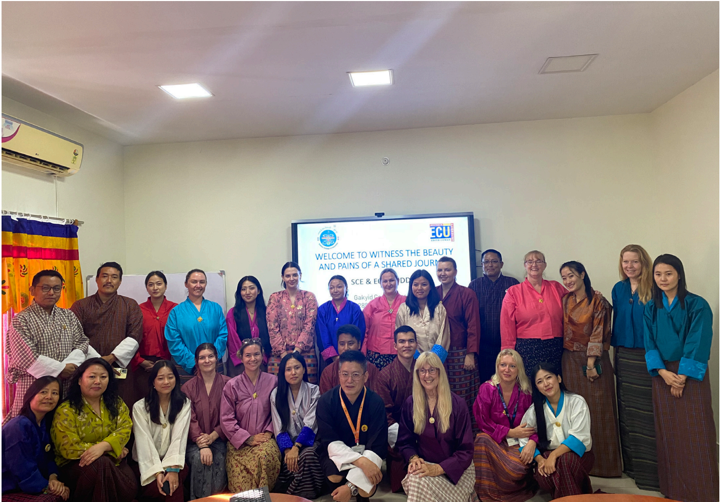
A group photo after ECU and SCE students presented their joint project

The visit of Australian students and professors to Samtse College of Education not only solidified international connections but also underscored the significance of cultural exchange programmes in fostering global understanding and cooperation. The memories created during this exchange will undoubtedly linger in the hearts and minds of all those involved.