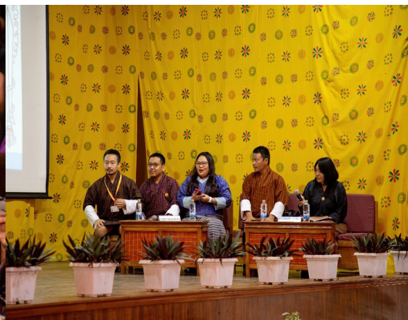
Paper presenters responding to the questions from the audience