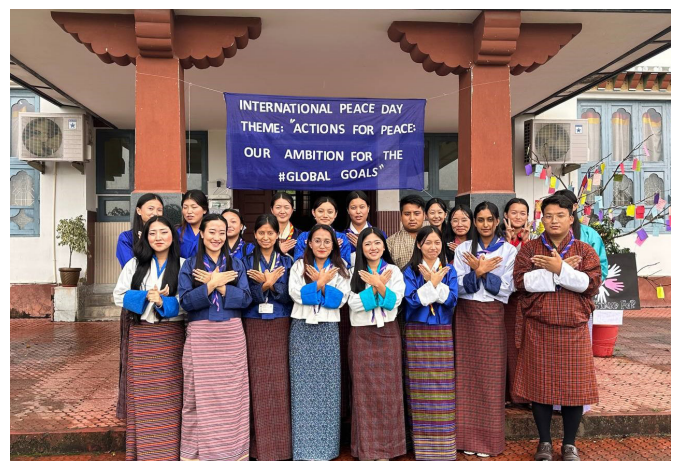
Messengers of peace

Through yoga, dance, pledges, and dialogue, the participants demonstrated that small actions can collectively lead to significant changes. International Peace Day 2023 reminded that, regardless of individual backgrounds and beliefs, all aspire for global peace and bright future.