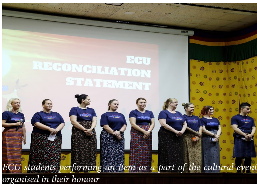
ECU students performing an item as a part of the cultural event organised in their honour

The Blessed Rainy Day celebration, with its amalgamation of cultures and joyous performances, left an indelible mark on all who attended and flaunted the power of cultural exchange and the beauty of diversity, fostering a sense of unity and celebration among all present.