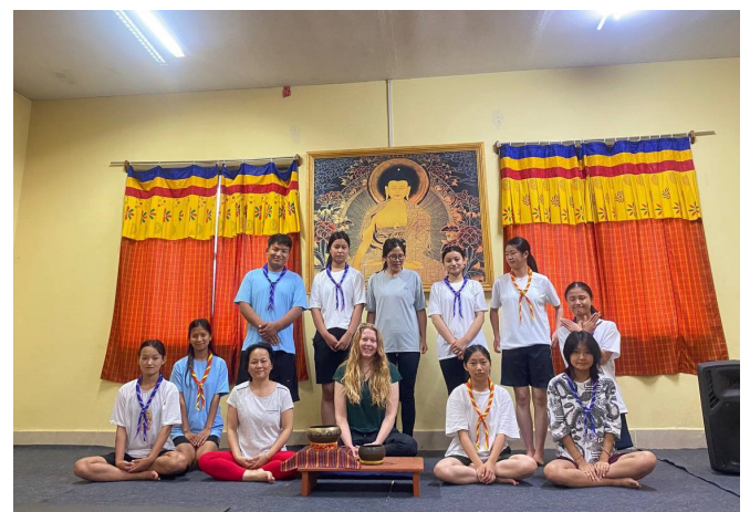
Yoga group posing for a group photo after the session