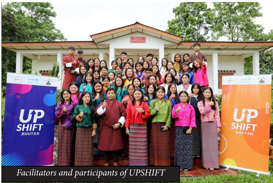
Facilitators and participants of UPSHIFT

A s a follow-up to the introduction of the UPSHIFT Programme to the students of Samtse College of Education (SCE), sixty-one students from two Bachelor's programmes, namely Bachelor of Arts in Social Work (BASW) and Bachelor of Education in Information Technology, English, History, and Geography (B.Ed IT & B.Ed Eng/His/Geo), actively participated in the UPSHIFT workshop held on 26 th August, 2 nd , and 9 th September 2023.