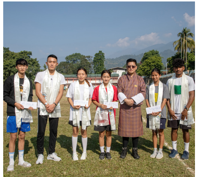
The College President with the winners of the Marathon

The event, beyond its commemorative aspects, underscored the College's commitment to building a healthy and vibrant community. The impressive performances and enthusiastic participation reflected the College's dedication to promoting physical fitness and a strong sense of togetherness among its faculty, staff, and students.