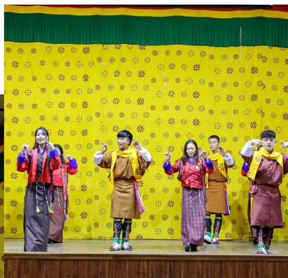
SCE students performing a cultural dance