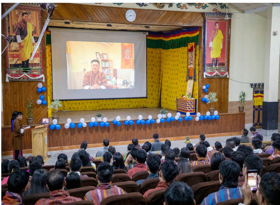
President's message to graduates via zoom

Overall, the M.Ed graduation night was a wonderful celebration of hard work, dedication, and success. It was a fitting send-off for the graduates as they embark on the next chapter of their lives.